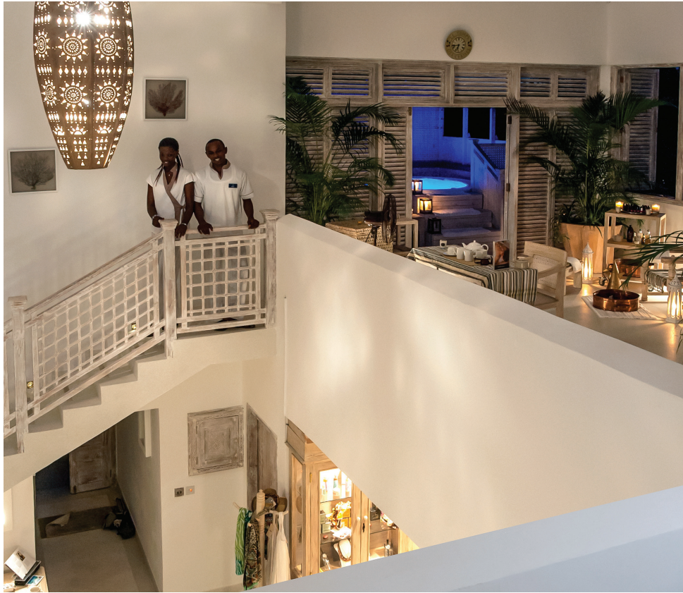
SAKINA OCEAN SPA AT MEDINA PALMS

Scented treatment rooms include single, double and hydro therapy facilities, all with mood lighting and soft sound options. There are cooling Indian Ocean breezes on the shaded roof terrace which features an open air spa pool and is a perfect place to relax with friends: enjoy manicure and pedicure treatments, whilst sipping refreshing fruit cocktails or healthy juice boosters.