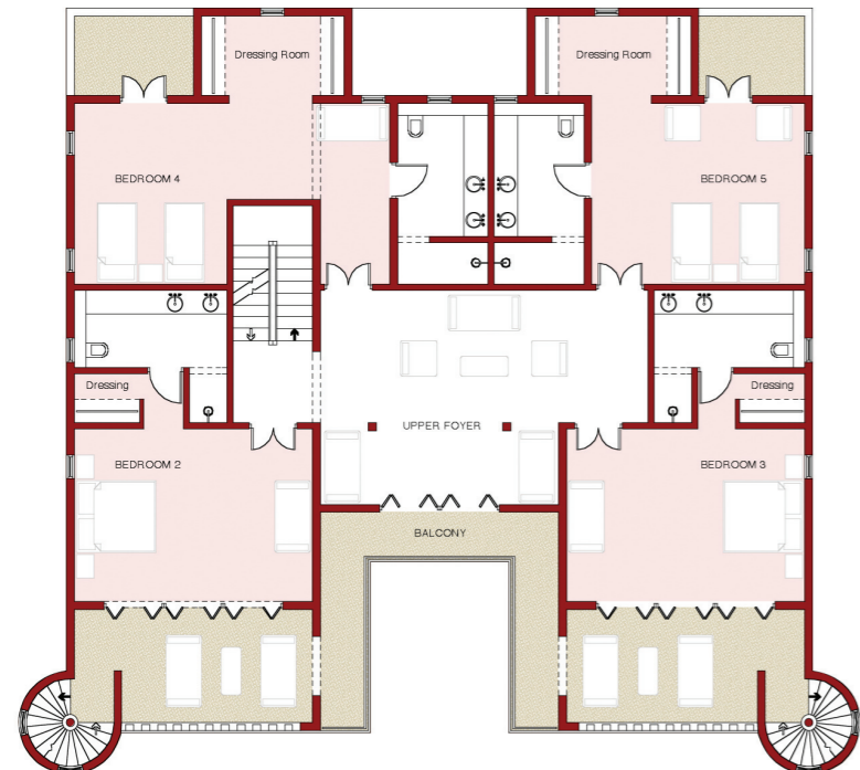
First Floor (m)