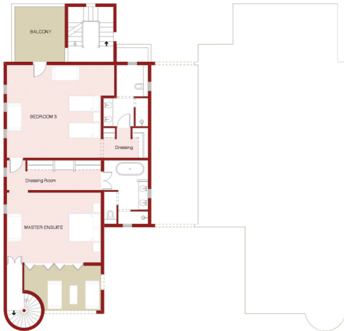
First Floor (m) Master Bedroom 6.0 x 4.5 Ensuite 4.4 x 2.8 Dressing Room 6.0 x 2.5 Covered Balcony 4.9 x 2.8 Bedroom 3 6.0 x 5.5 Ensuite 3.4 x 2.8 Dressing Room 2.8 x 1.9 Covered Balcony 6.0 x 2.8