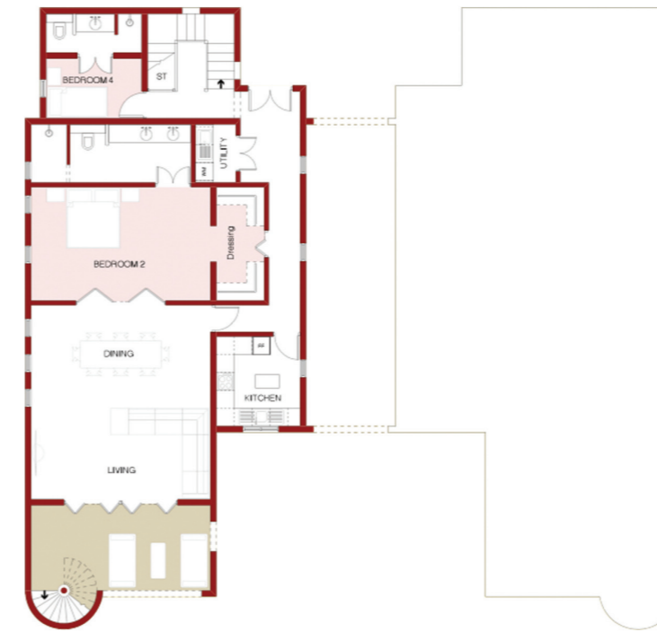
Ground Floor (m) Bedroom 2 6.0 x 3.8 Ensuite 5.5 x 2.0 Dressing Room 3.5 x 1.6 Kitchen 3.0 x 2.8 Lounge/Dining 6.5 x 6.0 Store 2.0 x 1.5 Covered Veranda 6.0 x 2.8